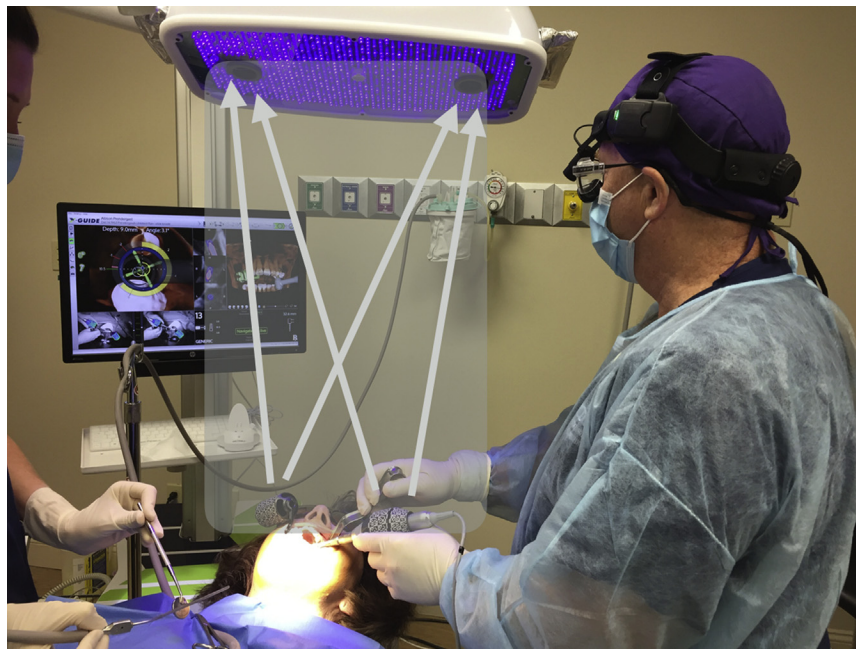
FIGURE 1. The dynamic system in use. The light source above the patient reaches the patient tracking array and the array on the handpiece. The light is reflected from the arrays to 2 high-definition cameras (arrows). The captured reflected light is transmitted to the system-specific navigation computer to create the dynamic real-time representation.

Block et al. Implant Placement Using Dynamic Navigation. J Oral Maxillofac Surg 2017.